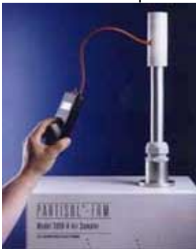
Direct Fit to Sampler